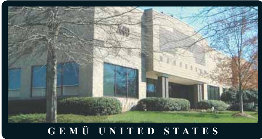
GEMÜ UNITED STATES

Gemü Valves, Inc. was established as a subsidiary of Gemü Gebr. Mueller GmbH and Co. KG, Germany and Gemü CH, Switzerland in 1989, to represent and sell Gemü valves product line in the following territories: North America, Mexico and Canada.